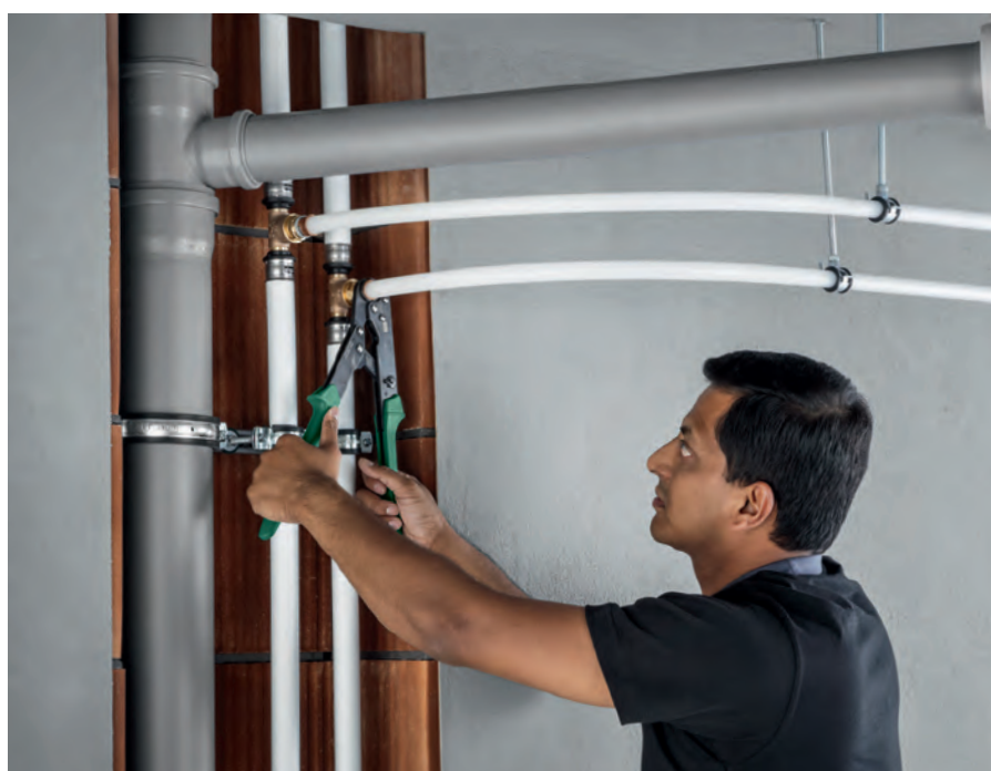
A strong team: Viega Smartpress for riser pipes, pressed with the Viega Pressgun, and the threaded transition to Viega Speedpress for the rest, while using the Viega hand press tool.