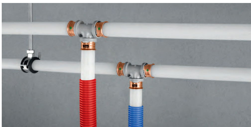
Potable water installation with T-pieces.

The customary type of installation for drinking water is the T-piece installation in which each outlet point is connected to a branch line. Due to its good flow characteristics, Viega Speedpress can be downsized to 16 mm for outlet points like toilets or washbasins – that saves material costs.