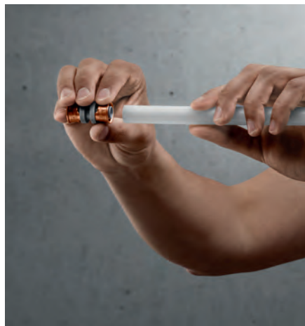
Step 2: Insert Next, the pipe is simply inserted into the connector, until the pipe is visible in the large inspection window.