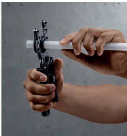
Step 1: Cut The pipe is cut to the required length. Since pipes are delivered in coil form, unnecessary wastage could be avoided during cutting.

The new Viega Speedpress makes potable water installations simple and handy. And this is how it works: