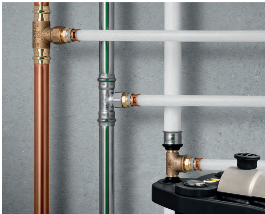
Viega Speedpress is fit for connection to all riser pipes, whether made of plastic, stainless steel, or copper.

This system with more than 400 different components offers a wide selection of press connectors in dimensions from 15 to 54 mm. The pipeline installations made of high-alloy stainless steel are suitable for hygienic potable water installations e.g. in hospitals.