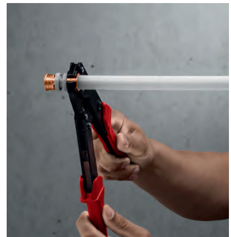
Step 3: Press Last, the connection is pressed with the new hand press tool, which hardly takes few seconds. The SC-Contur ensure additional safety.